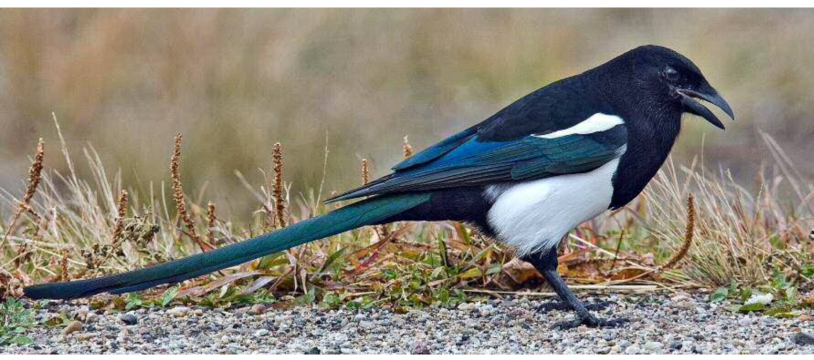
Alan D. Wilsom, Wikipedia

It is a black, blue and white bird as seen in the photo below, although the blue on its wings and tail is really a blue-green iridescence, not always visible. In addition to its white belly and scapulars (shoulders), it also has bright white wing patches that can be seen when it flies. It