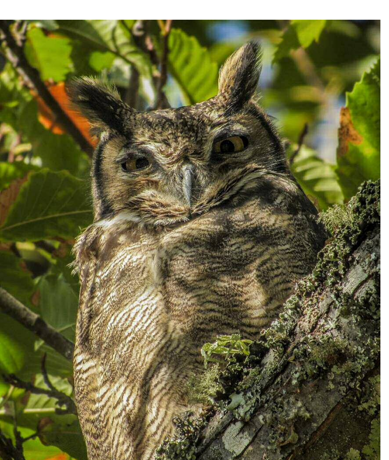
When Fred saw the Magellanic Horned Owl (at left), it happened to be in a cavity on the side of a small cliff, poking its head out while Fred and the other birders were looking for birds along a dusty roadside stop near the city of Trelew, about 65 km south of Port Madryn.

but the Great is larger with longer ear tuffs and broader bars on its underparts.