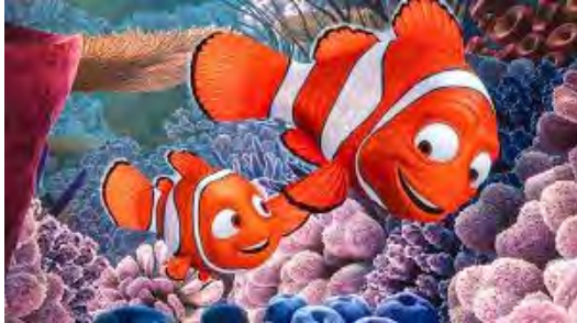
Finding Nemo (2003) Walt Disney Pictures

Other species will start out as one sex and later in life revert to another sex. Clownfish start as hermaphrodites, but eventually most become male and live in a school with a dominant female. When the dominant female dies, her mate takes her place and changes from male to female. So, in the animated movie, Finding Nemo , Nemo's dad lost his mate, which means Nemo's dad would have become Nemo's new mom, if Disney were to be biologically accurate (but if they did that, then fish wouldn't talk and it'd be a short movie).