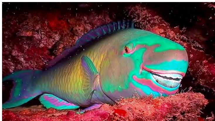
Happy-looking parrotfish probably taking delight in breaking our expectations.

That is what makes Nature so fascinating though. It doesn't always follow the rules humans imposed upon it. It seems to do things the way it wants, when it wants, and how it wants with little regard for what we think it should do. Life does indeed find a way. And we wouldn't want it any other way.