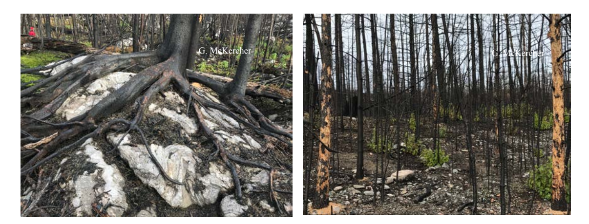
Aftermath of the 2018 forest fire near RiverValley in West Nipissing

<u>The Canadian boreal forest</u> is a mosaic of species and stands. It ranges in composition from pure deciduous and mixed deciduous-coniferous to pure coniferous stands. The diversity of the forest mosaic is largely the result of many fires occurring on the landscape over a long period of time. These fires have varied in frequency, intensity, severity, size, shape and season of burn. With new technologies such as isotope analysis it is hoped that we will be able to better understand the effects of forest fires on the ecology of out present day forests and integrate that knowledge into on-going forest management.